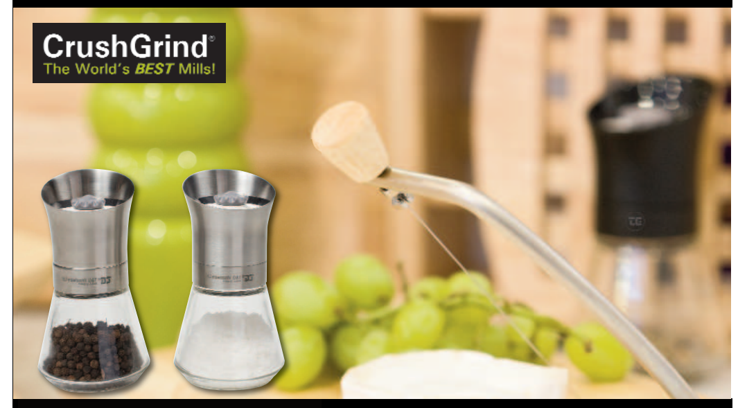
T&G's 'Tip Top' Mills are equipped with the original ceramic CrushGrind® mechanism.

The grinding parts of the mechanism is made in ceramic material. Ceramic is a pure, natural material. It is harder than steal and grinds salt & pepper and even whole dried herbs & spices.